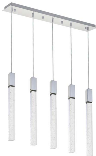
Chrome Item No: 2066S36C