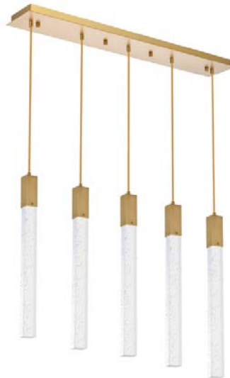
Stain Gold Item No: 2066S37SG